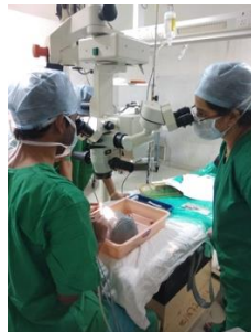
wet lab phaco training hands on